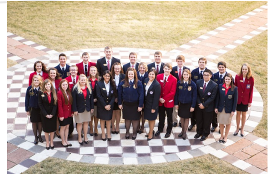
Nebraska Career Student Organization State Officers participating in the third annual CSO Legislative Day assembled in the State Capitol Courtyard to commemorate the event.

Career Student Organizations are a vital component of Nebraska's Career Education System and this annual event helps to educate legislators about their unique value.