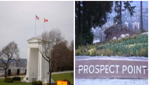
Region V Conference Attendees were provided the opportunity of a guided tour of Vancouver, BC, Canada