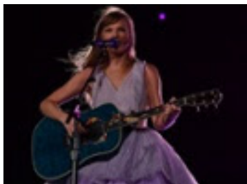
Swift